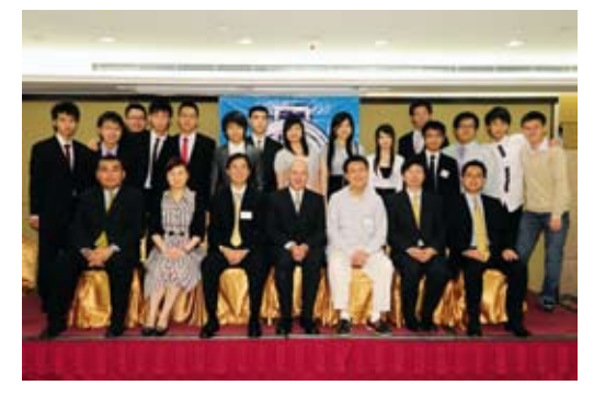
Mentees and Mentors.