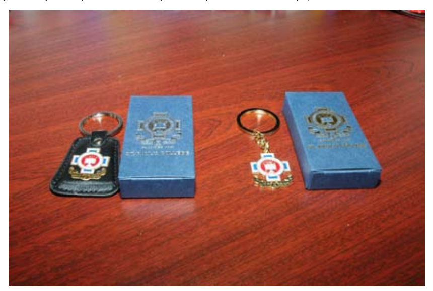
Key rings: $100 Leather, $60 metal