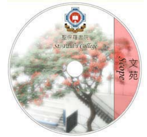
DVD: Scope (ever published, up to September 2008)$100 Wayfarer (ever published, up to September 2008) $200