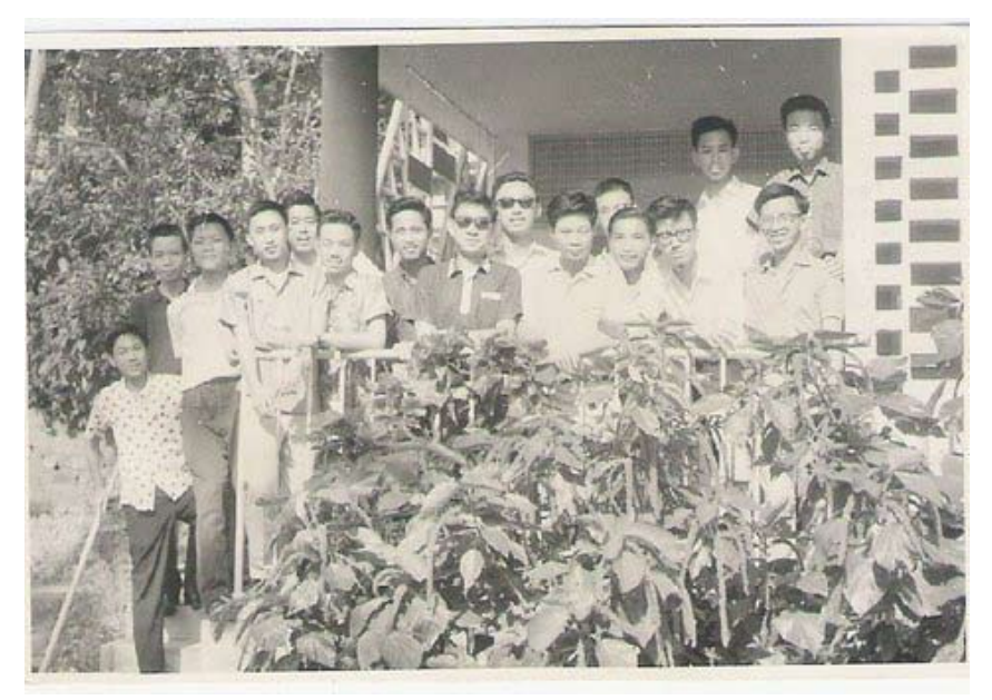
At the SPCAA Beach House in South Bay circa 1958