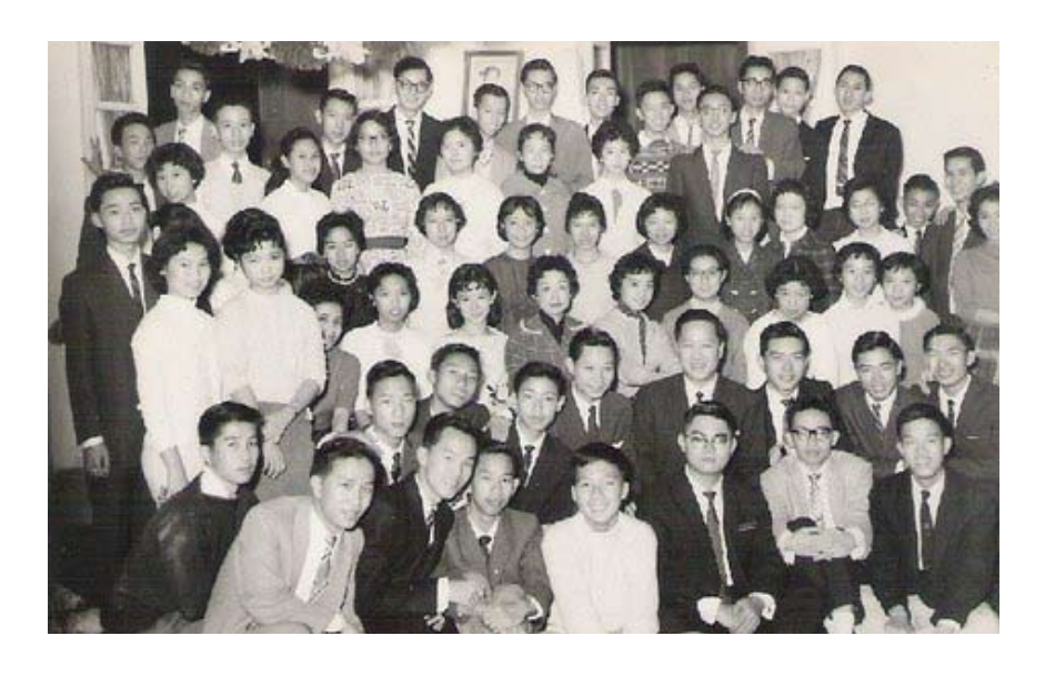
Desmond's Party in honour of teachers circa 1959