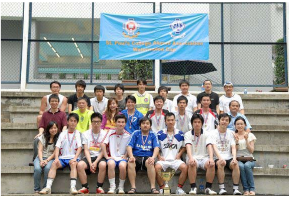
Younger groups on 31st May 2009.