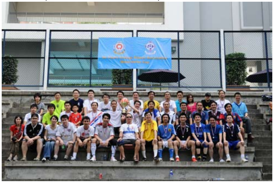
Participants on 17<sup>th</sup> May 2009.

This year, the Watermelon Cup was held on two separated Sundays, 17^{\text{th}} and 31^{\text{st}} of May. There were 12 teams each. The champions were Year 1991 on 17^{\text{th}} May and Year 1998 on 31^{\text{st}} May, 2009.